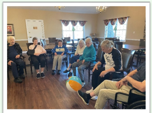
Legends folks playing "popcorn ball"