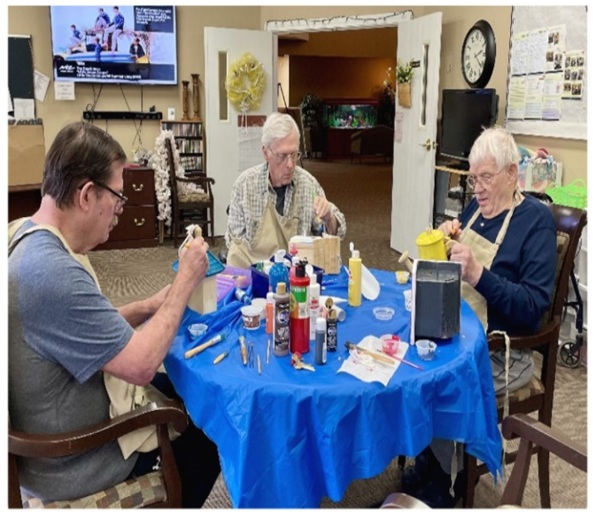
Men's Club Our first meeting. The men started painting bird houses for our court yard.