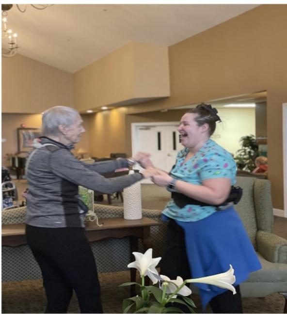
Cuttin the rug! 🎵