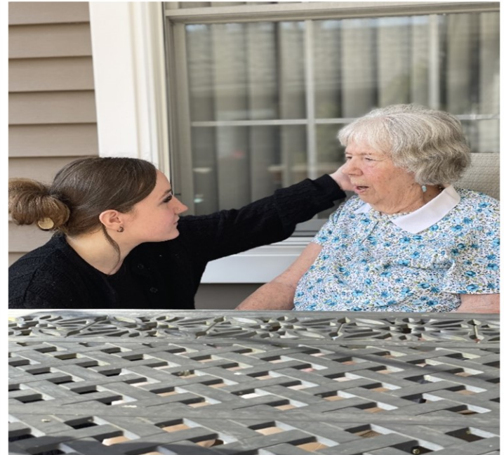
I Caught this special moment.